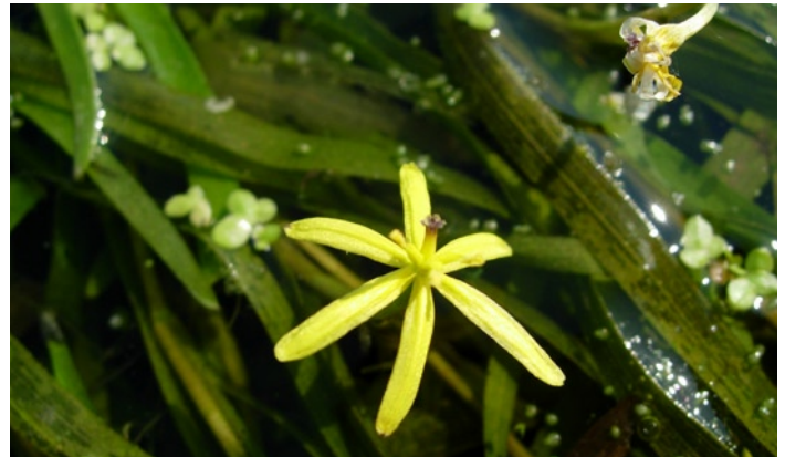
Stargrass, above, and other submersed vegetation benefit fish and wildlife but need clear water in which to grow. Achieving clearer water and beneficial vegetation is the goal of a standard proposed for the Mississippi River in the south Twin Cities area.

Public Comment Period: February 8 to March 26, 2010