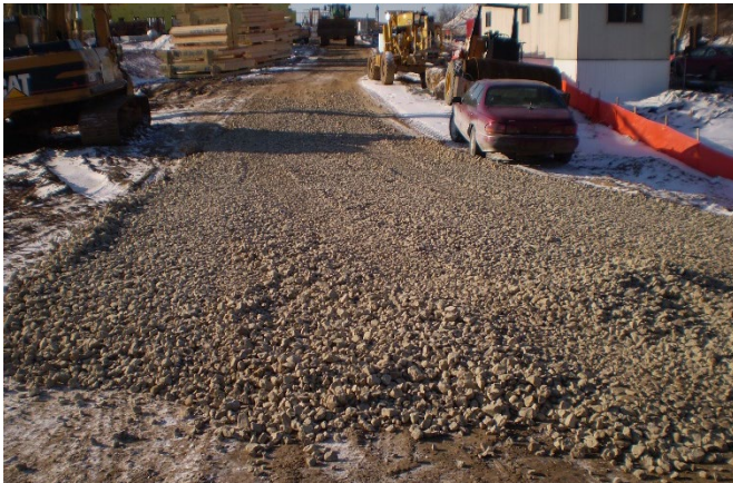
Add additional aggregate regularly to maintain a vehicle-tracking pad.