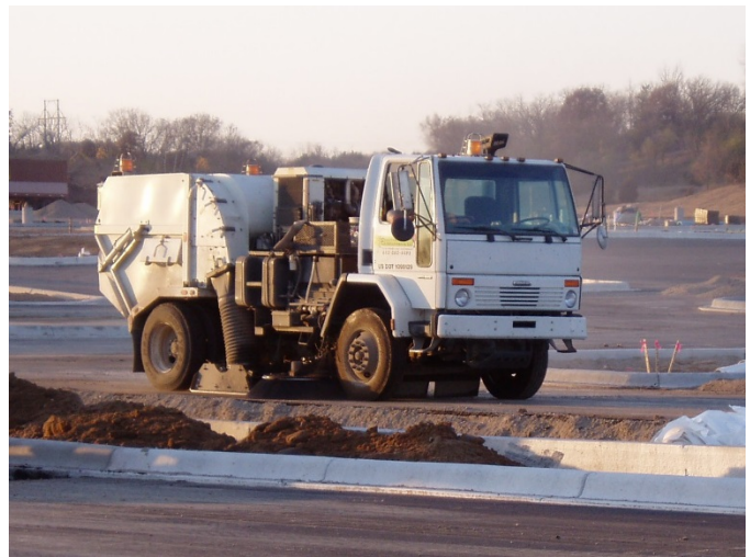
Street sweeping is required to remove any sediment that is tracked onto the street.

A combination of plowing and street sweeping may be necessary to ensure mud does not remain on the paved streets. Special attention should be paid to promptly remove all sediment and sediment laden snow and ice on the roadways prior to the spring melt.