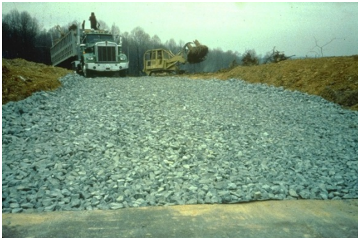
Vehicle tracking pads remove mud from tires and reduce the amount of sediment leaving a construction site.

Vehicles leaving construction sites track sediment onto adjoining roadways. This sediment can create serious safety hazards as well as contribute significantly to sediment pollution problems in waterways. Through the use of vehicle tracking pads and street sweeping, the amount of sediment and other pollutants leaving the construction site is limited and the amount of sediment discharged to surface water is decreased.