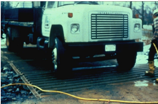
A vehicle wash rack may be needed to remove sediment from tires.