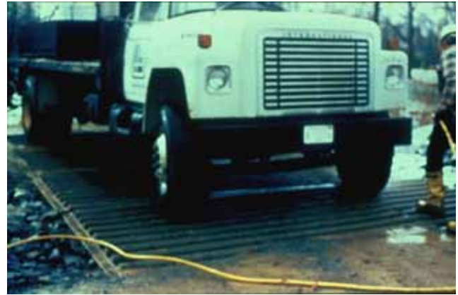
A vehicle wash rack may be needed to remove sediment from tires.

It is important to take into consideration the exact situation where the vehicle tracking pad will be used. Simple, sometimes inexpensive changes or additions to the vehicle tracking pad can make it more effective and prevent costly permit violations.