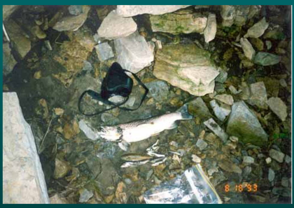
Class 1B2a waters, trout streams.