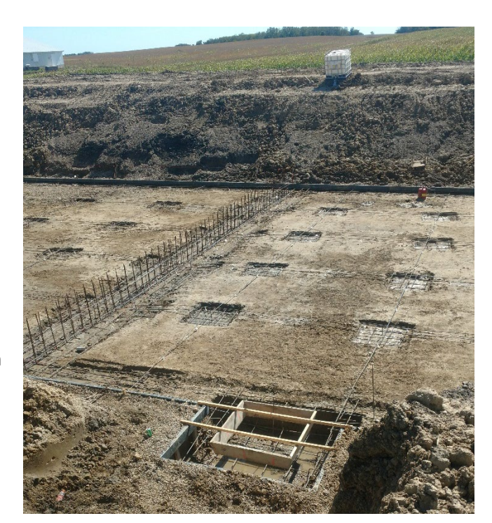
Liquid manure storage area under construction

For more information about the feedlot program, visit the MPCA website at: www.pca.state.mn.us/feedlots.