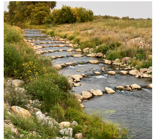
Rock "riffles" on Sand Hill River stabilize erosion and allow fish safe passage.

Our state's strategy aims to achieve more fishable and swimmable water in Minnesota.