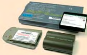
Lithium ion (Li-ion)