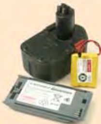
Nickel cadmium (Ni-Cd)