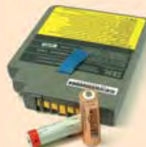
Nickel metal hydride (Ni-MH)