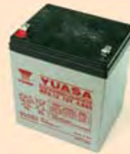
Small sealed lead acid (Pb)