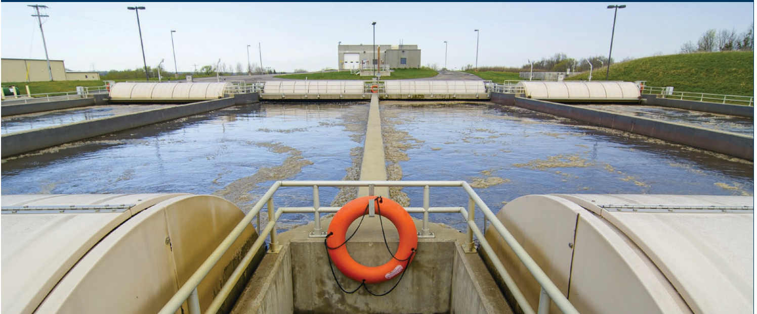
Buffalo Wastewater Treatment Plant

Marriott Northwest 7025 Northland Drive N. Brooklyn Park, Minnesota