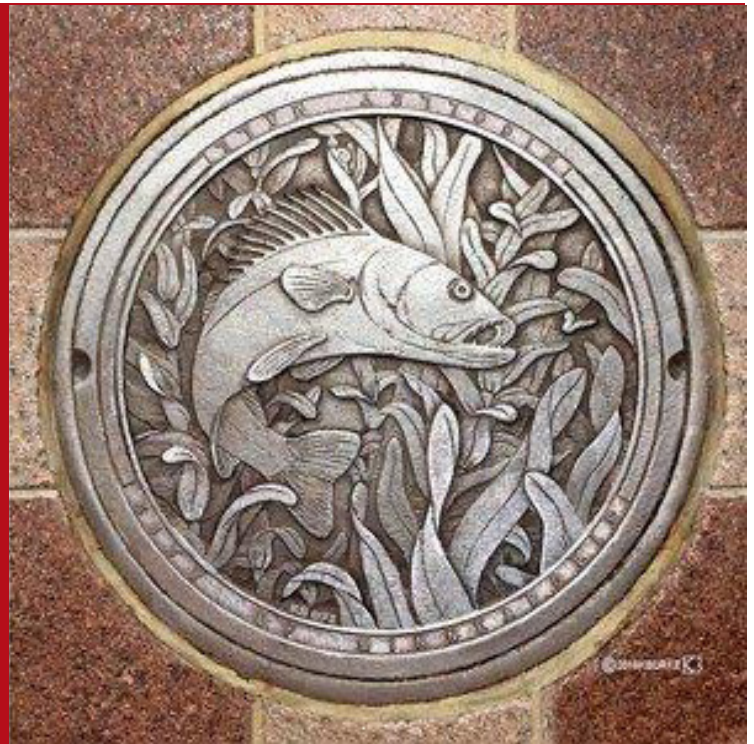
Manhole Cover in Minneapolis

Marriott Northwest 7025 Northland Drive N Brooklyn Park, Minnesota