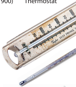
Cooking and fever thermometers