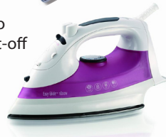
Auto shut-off iron

Take these items to your local Household Hazardous Waste site.