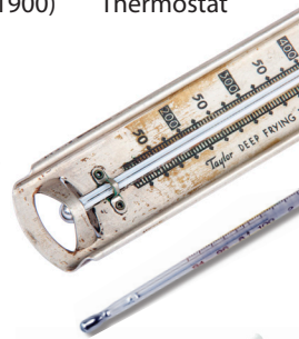
Cooking and fever thermometers