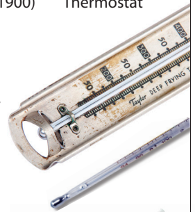
Cooking and fever thermometers