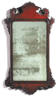
Antique mirror (pre-1900)