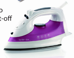
Auto shut-off iron

Take these items to your local Household Hazardous Waste site.