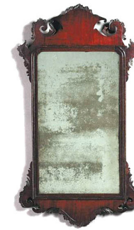
Antique mirror (pre-1900)