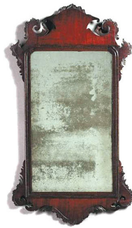
Antique mirror (pre-1900)