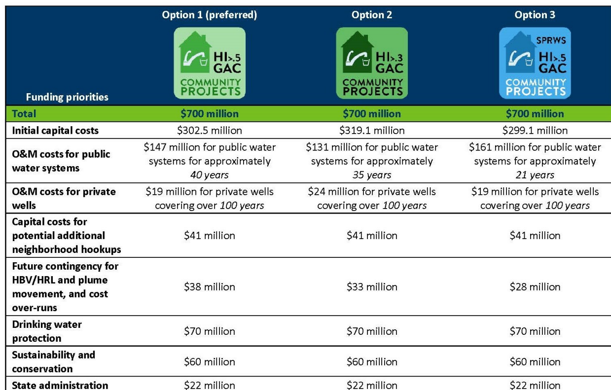
Figure 1: Overview of costs for each option