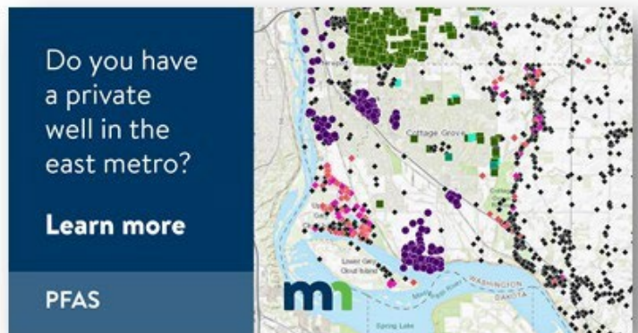
Figure 2: Most popular social media post; reaching 80,083 with 176,917 impressions