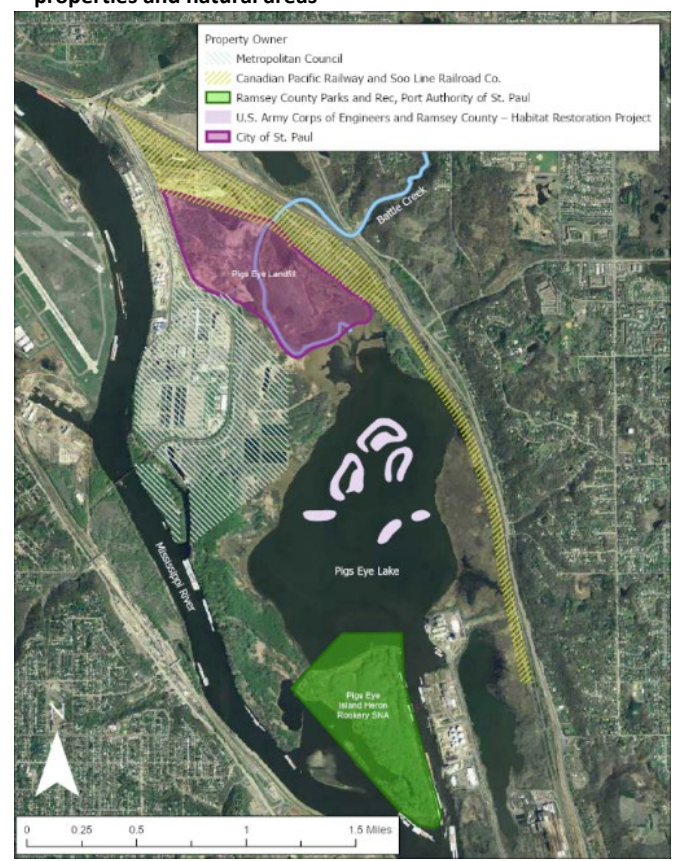
Figure 1: Pig's Eye Dump with neighboring properties and natural areas