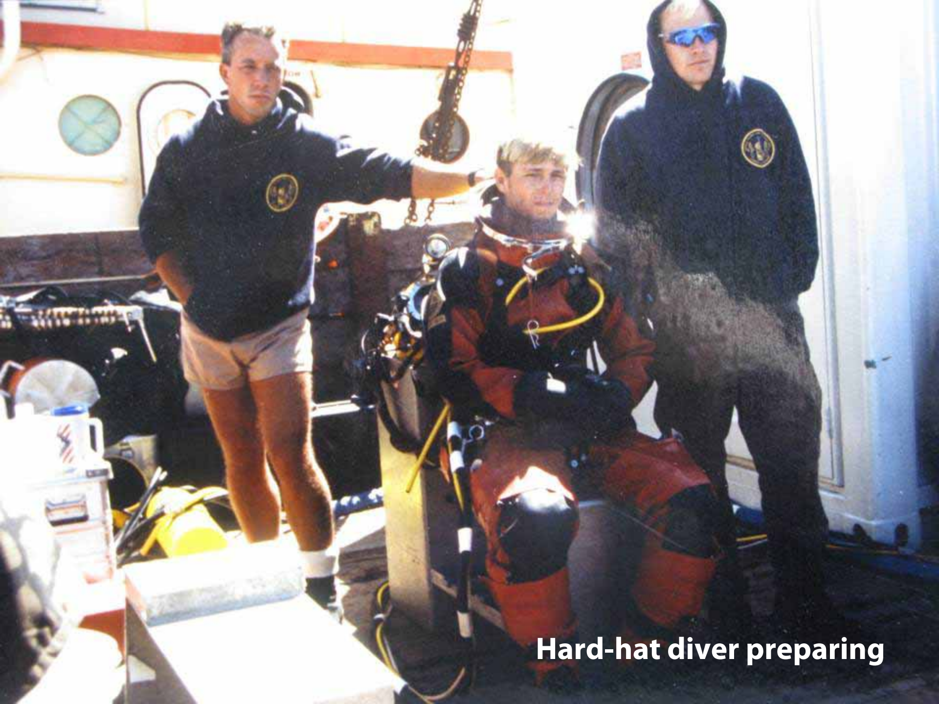
Hard-hat diver preparing