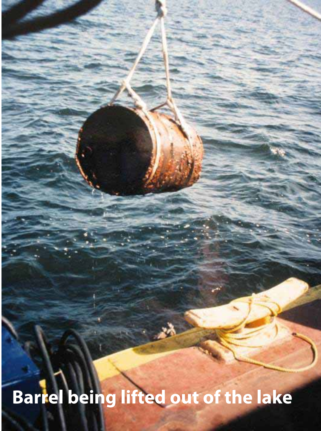
Barrel being lifted out of the lake