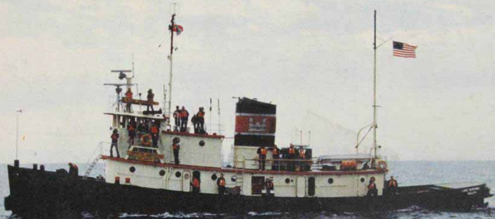
Dive team and media on board