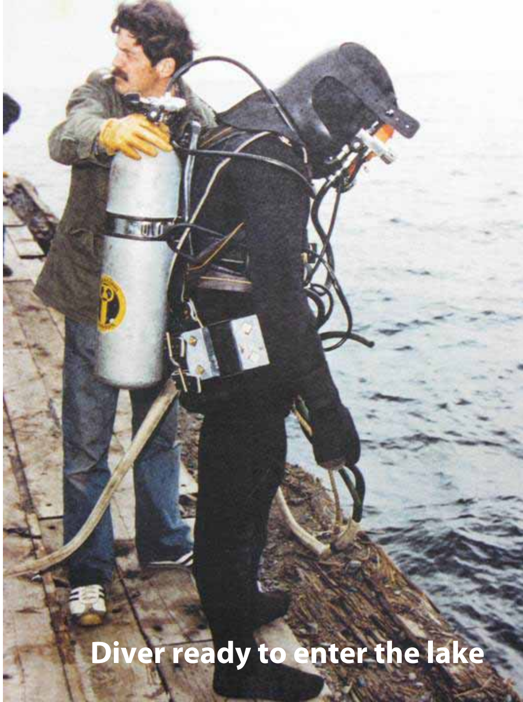
Diver ready to enter the lake