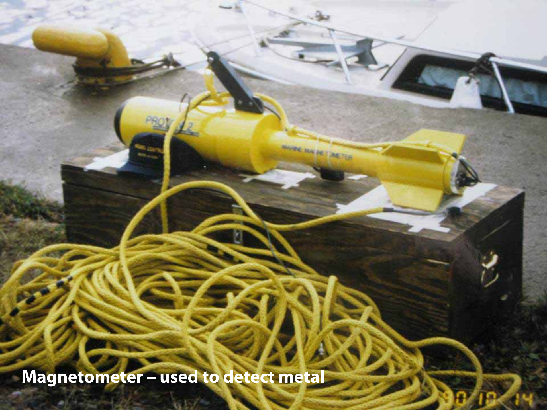
Magnetometer – used to detect metal