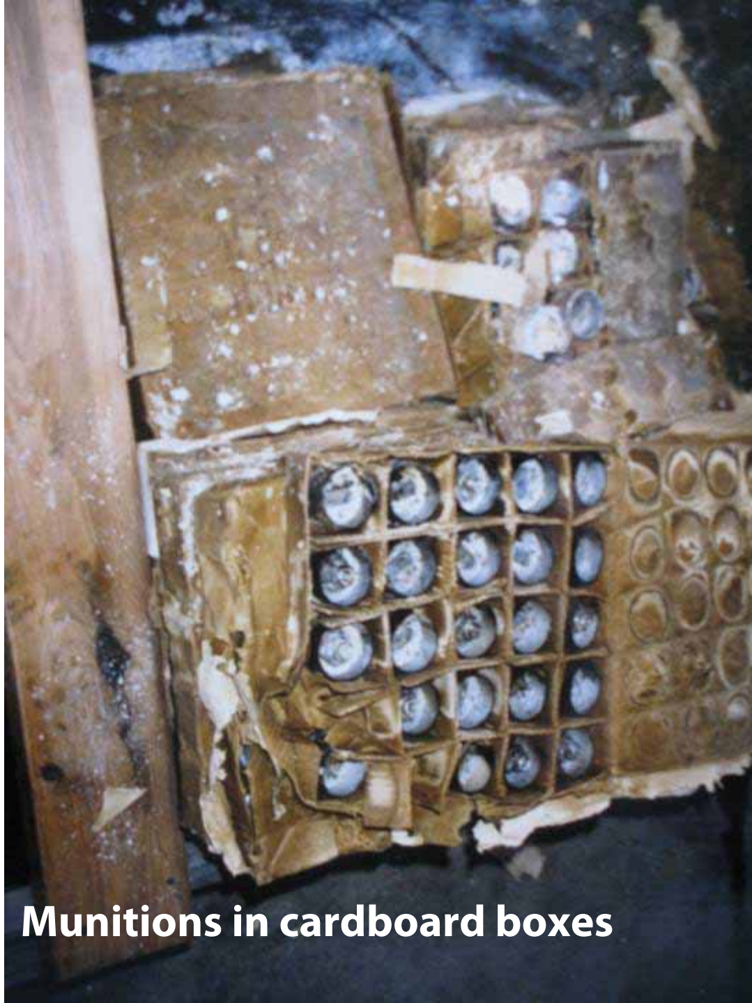
Munitions in cardboard boxes