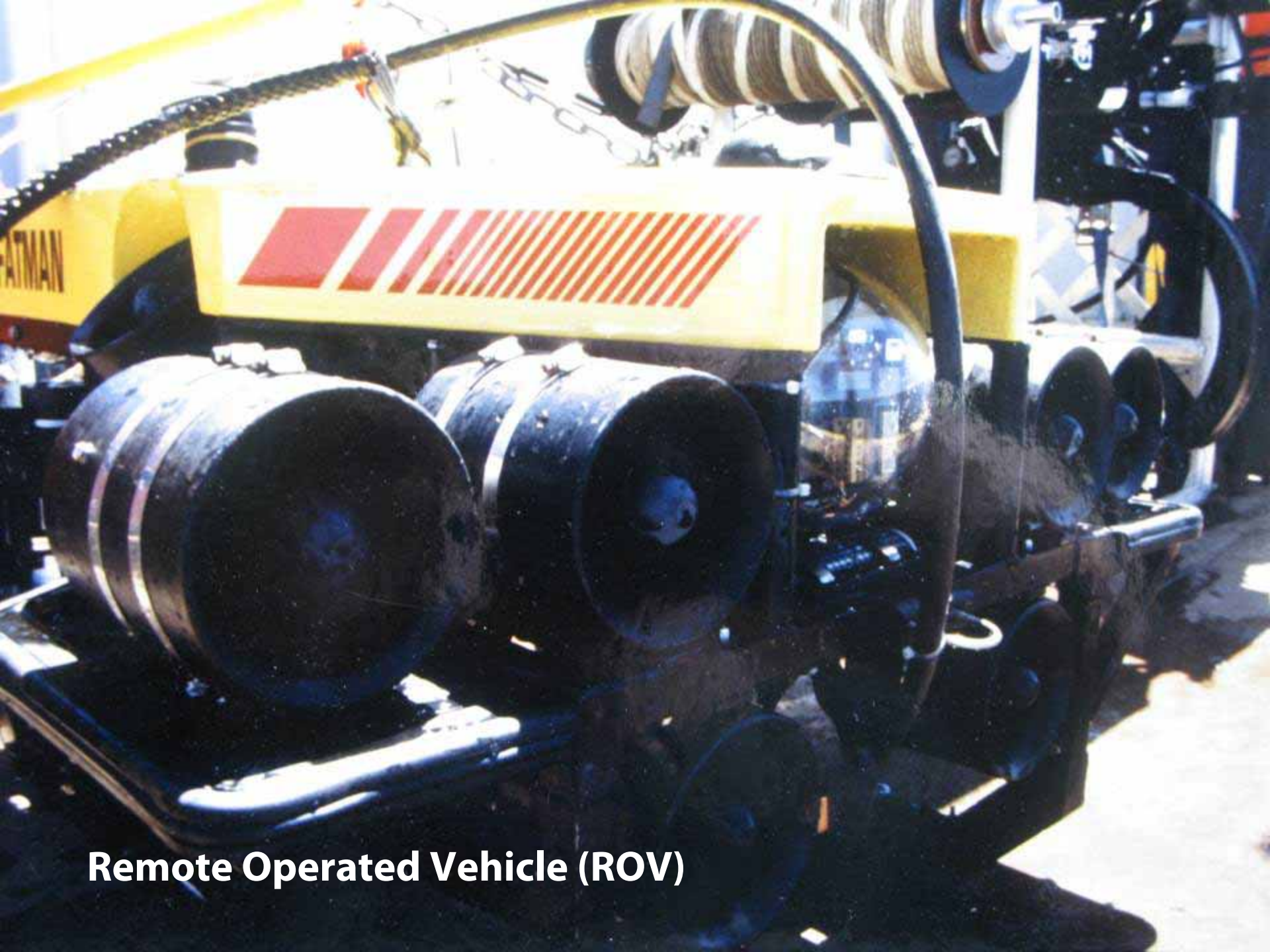
Remote Operated Vehicle (ROV)