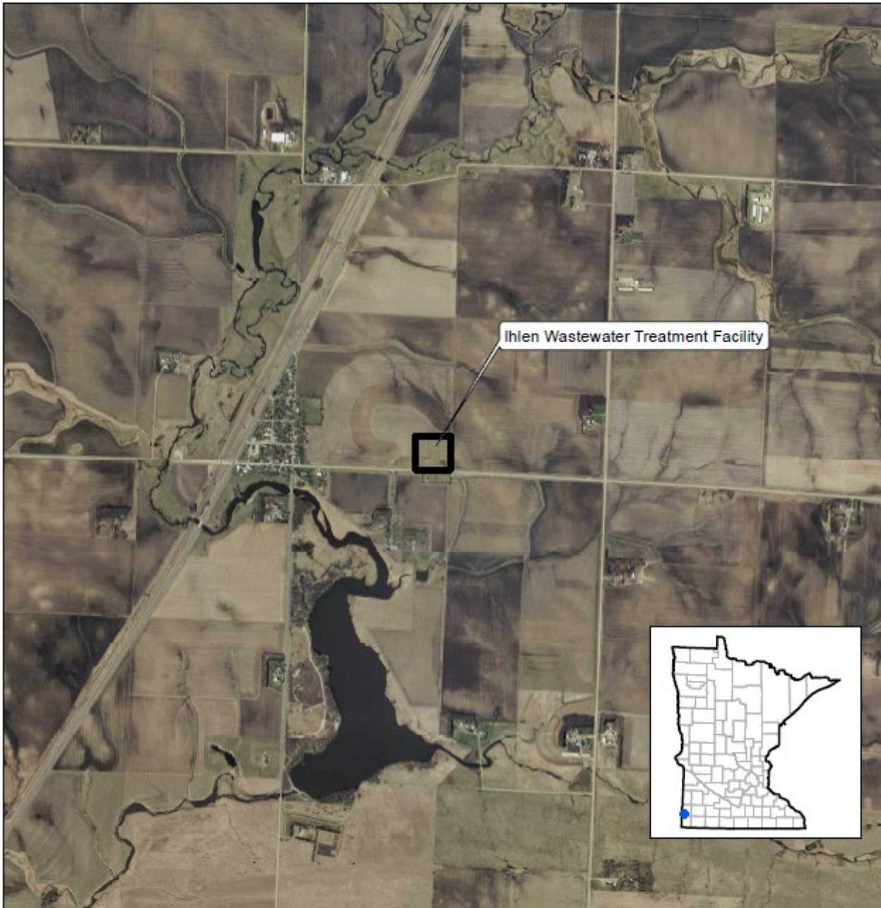
Map produced by: MPCA Staff, 7/21/2020 Scale: 1:24,000

MN0063100: Ihlen Wastewater Treatment Facility T105N, R46W, Section 10 Ihlen, Pipestone County, Minnesota