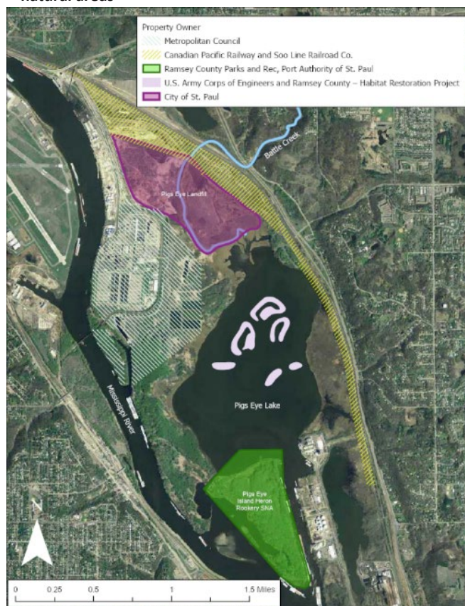
Figure 1: Pig's Eye Dump with neighboring properties and natural areas