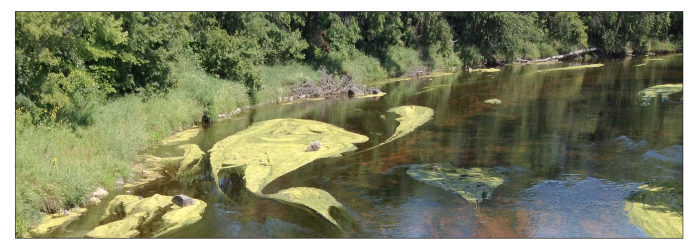
Filamentous algae growth on 6/25/2015. Continuous DO data from this site recorded excessive DO flux, likely caused by extensive algae growth during the day followed by decomposition at night, which uses up available oxygen.