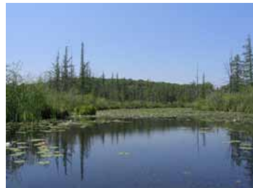
School Lake is one of six lakes being studied for a reduction in pollutants.

From 2002 to 2008, the Minnesota Pollution Control Agency (MPCA) listed the first five lakes as “impaired” for excess nutrients, meaning their nutrient levels exceed state standards for water quality.