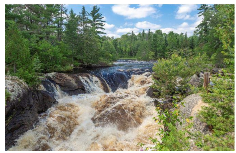
Since most of the Vermilion River Watershed remains undeveloped and its waters unimpaired, local efforts are focused primarily on identifying and implementing strategies that will protect this pristine region of the state.

The Core Team associated various "risks" and "qualities" with each of the strategy types and attributed them to the waterbodies within the watershed. This formed the basis for the protection prioritization and targeting process.