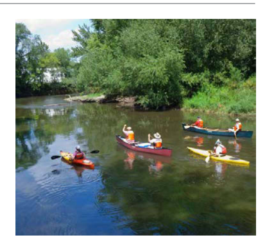
Paddling and other recreation are popular in the Cannon River Watershed.