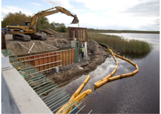
Use floating silt curtain for work in the water as secondary containment to contain sediment close to the work area.

Floating silt curtain is not designed to prevent sediment from entering surface water. It is designed to help contain suspended sediment within the water column until it has settled to the bottom of the water body. Therefore, floating curtain's only use may be for work that cannot be done outside the water or as an additional containment to minimize the impact of a water quality violation and keep the damage to the water body near the shore and the sediment recoverable.