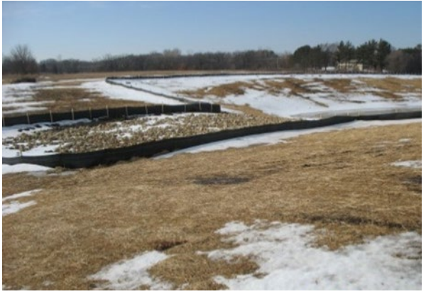
Silt fence used as perimeter control

The National Pollutant Discharge Elimination System/State Disposal System (NPDES/SDS) Construction Stormwater Permit (Permit) requires that certain sediment control BMPs are utilized to minimize sediment leaving a construction site. Sediment controls located at downgradient boundaries of the construction site are referred to as perimeter controls. The location and type of perimeter control BMPs, along with other sediment control BMPs required by the Permit, must be identified in the site's Stormwater Pollution Prevention Plan (SWPPP). The Permit also requires additional sediment controls to be utilized at the base of soil stockpiles to contain sediment and must be installed prior to the initiation of stockpiling.