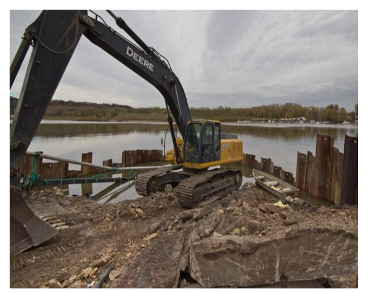
Coffer dams made of sheet metal to isolate the work area from the surface water.

More specialized types of sediment control BMPs may be needed to protect surface waters during construction