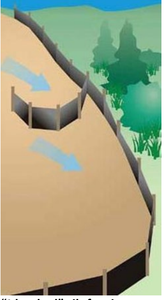
"J-hooked" silt fencing