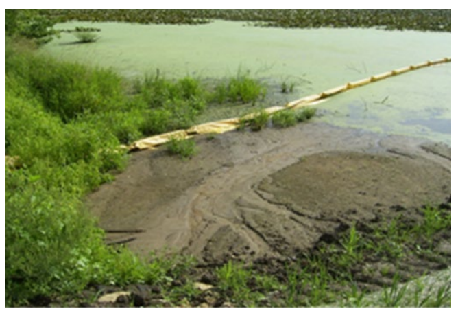
Relying on floating curtain as downgradient perimeter control will result in permit violations for failure to install sediment control and in most cases will result in water quality violations.