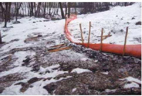
Regular maintenance is needed to ensure that a site's perimeter control is functioning properly.

If construction is going to continue during the winter and new areas will be disturbed, that requires new sediment controls; materials such as compost logs, fiber rolls, rock bags, and rock filters can be installed over the snow cover. These installations will need extra care and frequent inspections to assure continued effectiveness.