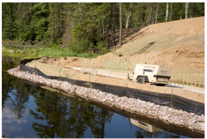
Move perimeter controls up the bank as the bank is stabilized.

When work must occur within the 50-foot natural buffer of a surface water, redundant perimeter controls need to be installed before upgradient work begins. The perimeter controls should be placed five feet apart at the water's edge during work on the bank or shoreline. If possible, vegetation should be left between disturbed areas and the sediment control BMPs. As work is completed on the bank and the bank is fully stabilized, the perimeter controls can be moved upward away from the water's edge above the vegetated or rip rapped areas.