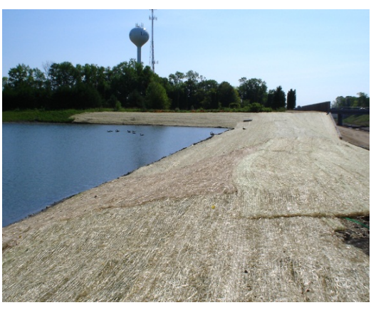
Erosion control blanket stabilizes pond slopes.