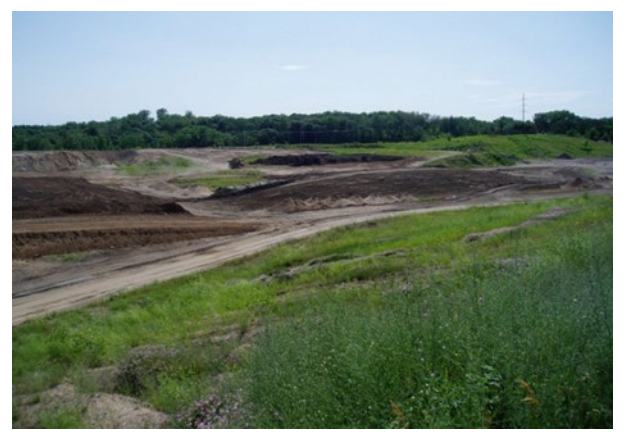
Slope tracking roughens the surface of a slope and decreases the velocity of runoff.

Leave as much vegetation on a site as possible to reduce the overall disturbed area.