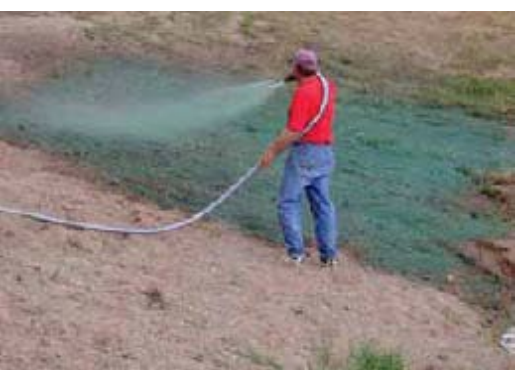
Hydrodraulic soil stabilizers promote the rapid growth of vegetation and prevent erosion.