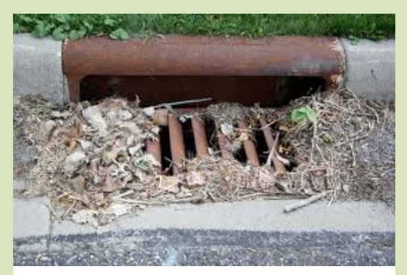
A storm drain funnels rain and snowmelt into stormwater pipes to prevent flooding. But, they also carry pollutants (like oil, deicers, and fertilizers) along with leaves and grass clippings into nearby lakes, streams, or wetlands.

We all live in a watershed. Sometimes it's obvious our property drains to a particular body of water; sometimes it's not. Those in the Lake Augusta watershed may not be aware their property eventually drains through storm sewers and into the lake (see map on front). Even if you live several blocks or miles from the lake, runoff from your property drains to the lake through stormsewer pipes under your street – essentially turning every curb into a shoreline. Stormsewer systems are different from the sanitary sewer systems in which water used inside your home is treated at a wastewater treatment plant before being discharged to a waterbody. Outside your home, stormsewers collect rainwater and snowmelt leaving your property and convey them to the lake without treatment.