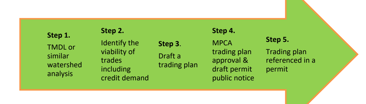
Figure 1. Steps to developing pollutant trading plan for wastewater.

Step 1. In order to trade, the MPCA and the parties need to have an understanding of the current condition of the water body and how it is being affected by point and NPS pollution in the applicable watershed. This information would likely come from a TMDL or similar watershed scale analysis.