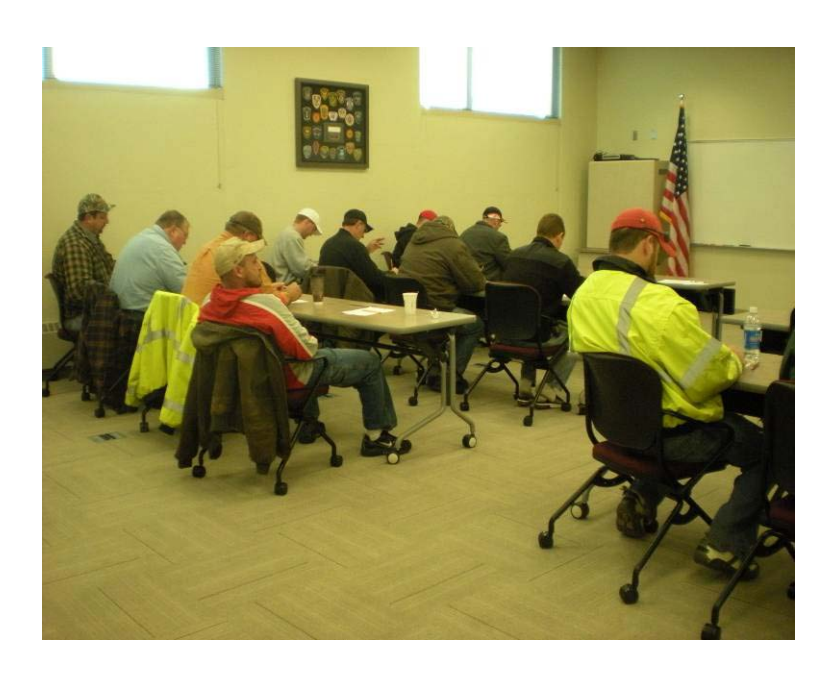
Taking the second-round KAP study, September 2010.