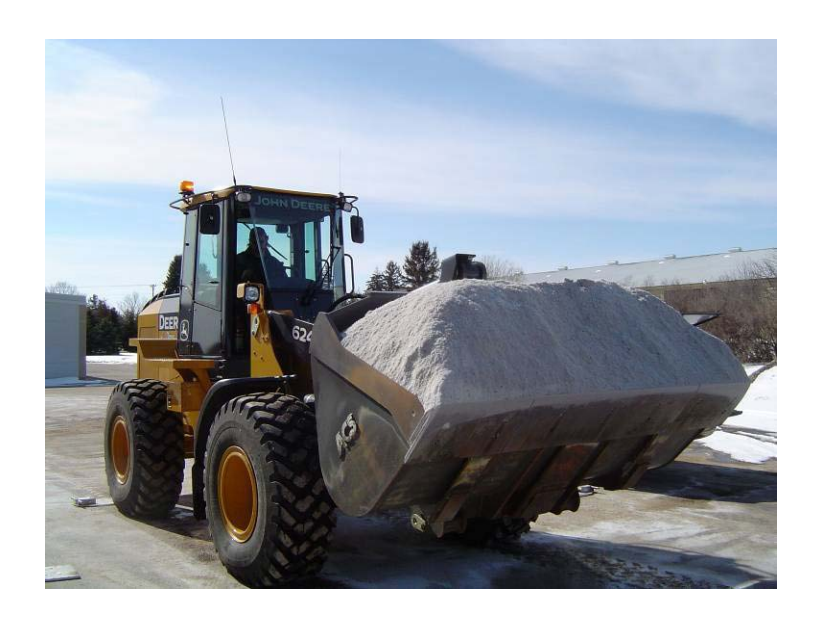
One ton of salt (about one scoop) will contaminate about 659,000 gallons of water after it dissolves and is carried by rain into lakes and rivers. Source: Fortin Consulting

Given the small sample size (n=26), it is important to note that just one or two responses could have reduced the percentages. However, the KAP results for these six questions point to specific areas where either supplemental training or clearer department policies could result in better outcomes. These slight declines, however, do not minimize the fact that for virtually all other questions, KAP values shifted in a positive direction or were unchanged.