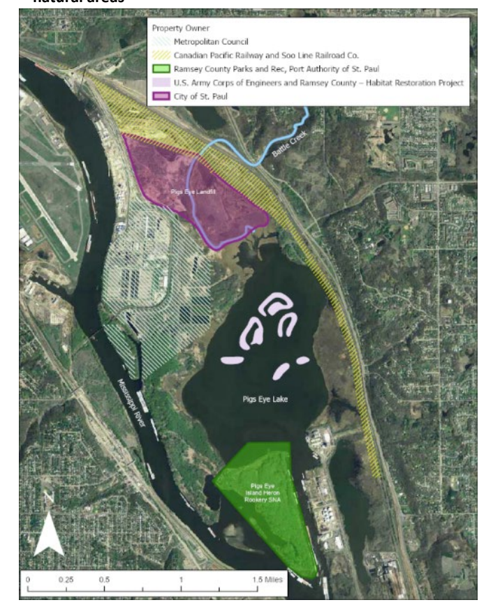
Figure 1: Pig's Eye Dump with neighboring properties and natural areas