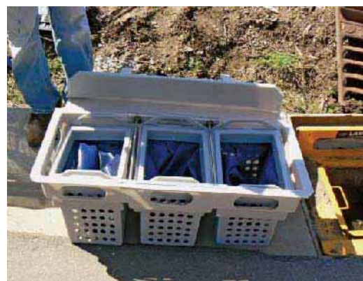
Stormwater inlet protection BMPs can be inserted into a catch basin to trap sediment from a construction site before it enters a storm sewer.

stormwater permit is available online: www.pca.state.mn.us/water/stormwater/stormwater-c.html .