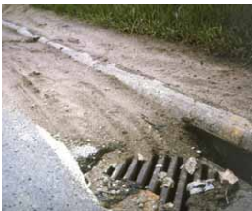
Sediment entering a storm sewer inlet as a result of construction related erosion.

Erosion is the natural process in which soil and rock material is weathered and carried away by wind, water or ice. On a construction site there are factors such as rainfall, climate, location, and soil type that influence erosion and may not be controllable.