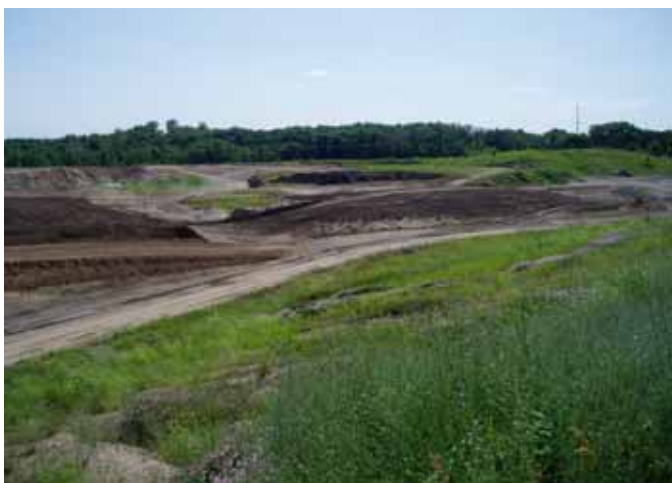
Leave as much vegetation on a site as possible to reduce the overall disturbed area.

Any and all tools that you plan to implement on the site should be included in the site's SWPPP. When writing the SWPPP, include a description of the practices and integrate them into the time line of all construction activities. In addition, label the locations of the practices on site plans and include detailed specifications for each practice. Including these elements into the SWPPP before construction activity begins will aid in proper planning for the site and ensure that the sediment and erosion control techniques are implemented effectively and efficiently.