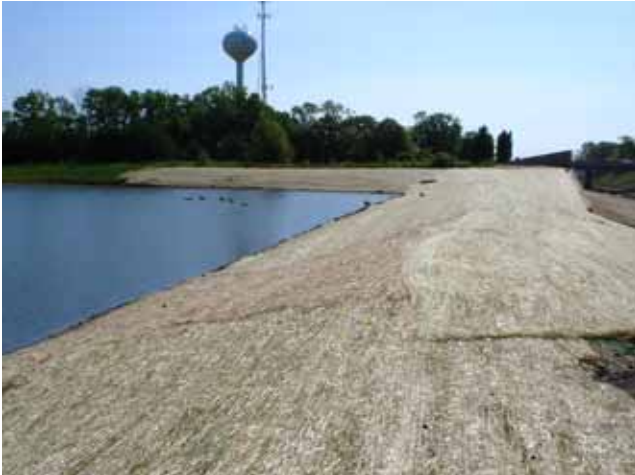
Erosion control blanket stabilizes pond slopes.

to promote vegetation establishment. A wide variety of blankets and mats exist for use under varying circumstances. In addition, compost can be used for erosion control and site stabilization. For more information, see the Minnesota Stormwater Manual at http://www.pca.state.mn.us/publications/wq-strm9-01.pdf .