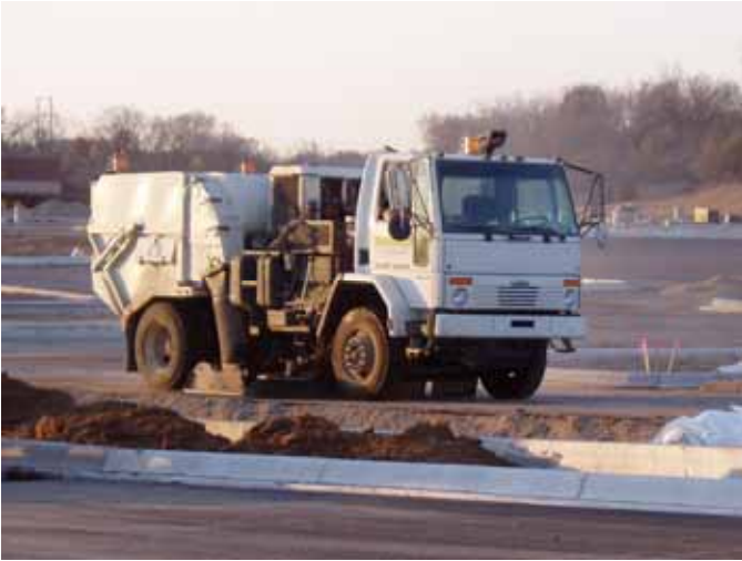
Street sweeping is required to remove any sediment that is tracked onto the street.