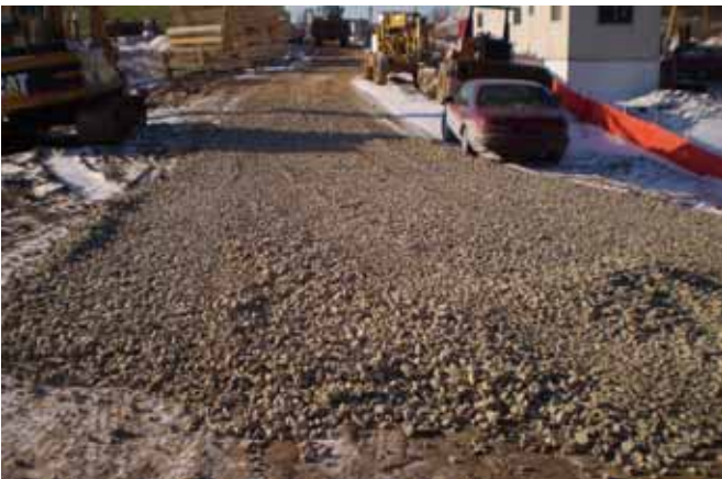
Add additional aggregate regularly to maintain a vehicle tracking pad.

A combination of plowing and street sweeping may be necessary to ensure mud does not remain on the paved streets. Special attention should be paid to promptly remove all sediment and sediment laden snow and ice on the roadways prior to the spring melt.