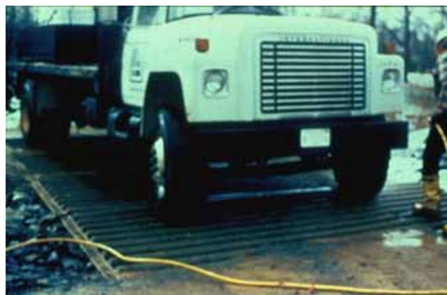
A vehicle wash rack may be needed to remove sediment from tires.

It is important to take into consideration the exact situation where the vehicle tracking pad will be used. Simple, sometimes inexpensive changes or additions to the vehicle tracking pad can make it more effective and prevent costly permit violations.