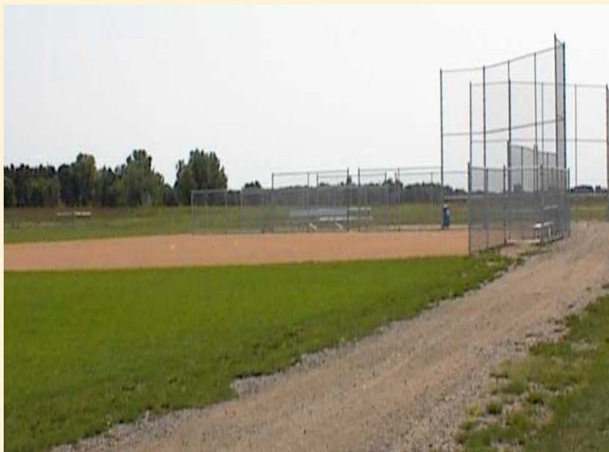
This Washington County site was formerly a "brownfield" and now is a baseball field.