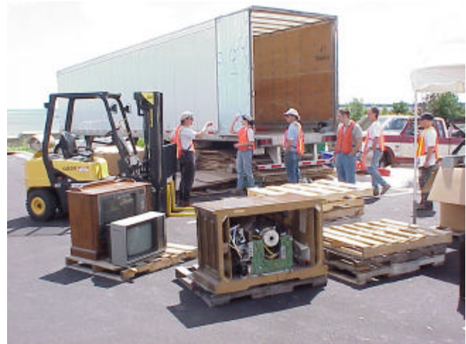
1999-2000 Collection Event. Plastics from televisions and other electronics collected at these events were separated, identified, and processed to determine recycling feasibility.

Using information from the 1999-2000 demonstration study, this project was designed to develop new, competitive, domestic demand for engineering plastics without government subsidies. In order to accomplish this goal, the OEA, the Wisconsin Department of Natural Resources (WDNR), the Illinois Department of Commerce and Economic Opportunity (IDCEO), and the EPA collaborated with Sony Electronics (Sony) and electronics demanufacturers (recyclers) in the EPA Region 5 states to establish a recycling infrastructure. This involved identifying and selecting a plastics processor to collect post-consumer plastics from the recyclers and process the material into plastic pellets that meet necessary specifications for Sony's applications. The potential for greenhouse gas reduction resulting from using post-consumer plastics in place of virgin plastics was also to be evaluated.