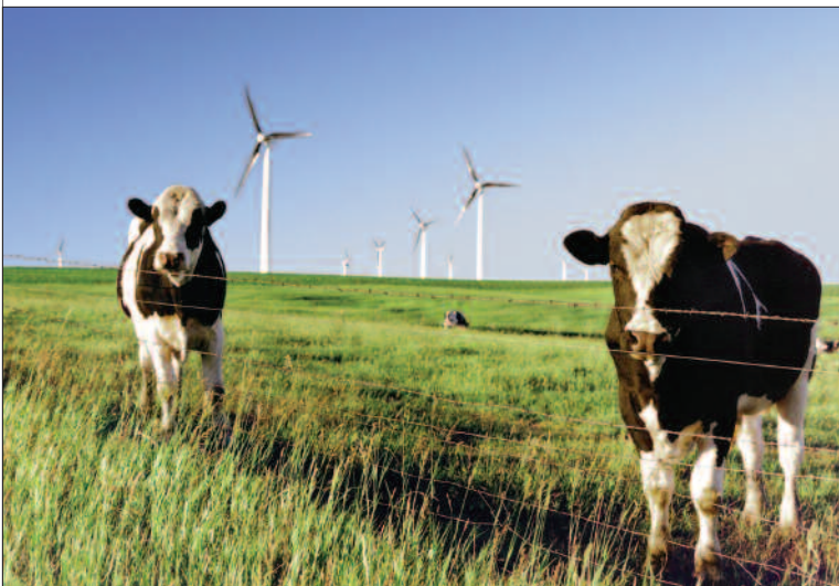
Wind turbines operate in harmony with farming and ranching. This is a wind farm in southwestern Minnesota, where the wind energy potential is among the nation's best.

Your purchase of green power will replace electricity that would otherwise come primarily from burning coal – one of the dirtiest fuels for producing electricity. Here in Minnesota, 75% of the energy we consume comes from coal – less than 1% currently comes from wind. Your purchase of green power can help change that, since most of Minnesota's electrical utility green power programs directly support new wind power, much of which is generated right here in our state.