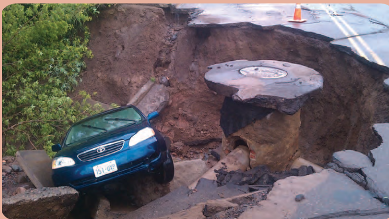
Duluth flooding, June 2012 (Look for multiple presentations on this topic.)

LOCATION: Marriott Northwest, Brooklyn Park (formerly Northland Inn) 7025 Northland Drive North