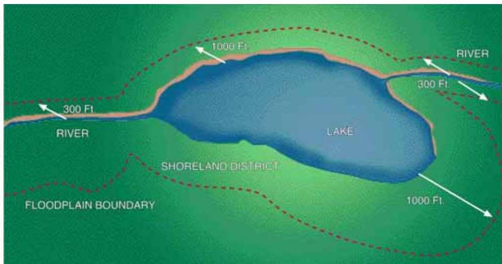
Figure 1. Shoreland

Shoreland areas are depicted in Figure 1. Lakes, ponds or flowages smaller than 25 acres in rural areas are not regulated under state shoreland rules (Minn. R. ch. 6120). However, some local ordinances may designate shoreland areas around public