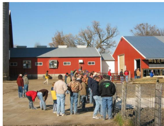
County feedlot officers tour a dairy during the convention in October 2006