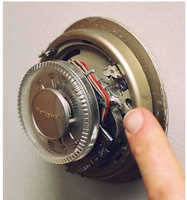
Mercury in homes is not always easily seen. Here, the cover has been removed from a wall-mounted tilt-switch thermostat to reveal the ampule of mercury behind the cluster of wires.

Should we stop eating fish because it contains methylmercury? No, but we need to be mindful of the risks posed by contaminants in fish. Fish remains an excellent source of protein, vitamins and minerals, and it is low in saturated fat. The oils in fish are important for brain and eye development, and the omega-3 fatty acids may help prevent heart disease.