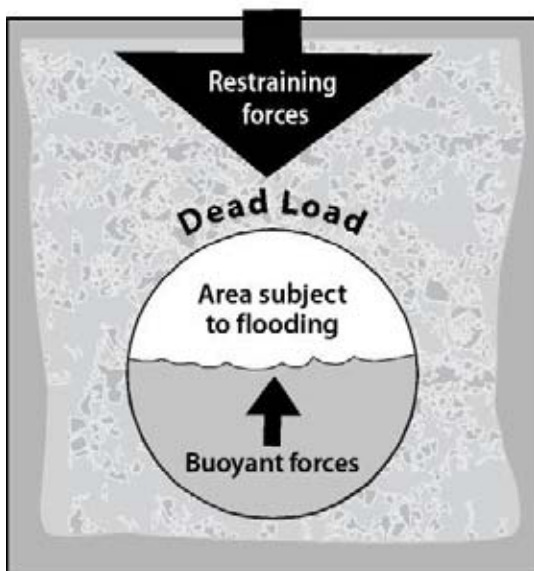
Figure 1. Tanks are typically buried 3 to 4 feet below finished grade to provide adequate slope for piping and protection from traffic loads. Except in areas with high water tables or areas subject to flooding, the weight of the backfill and pavement over the tank is sufficient to offset buoyance and prevent flotation.

If you have not properly anchored your tank and if floodwaters or rising ground water threaten your underground storage tank (UST) system, follow these steps to keep the tank in the ground and prevent water from entering the system: