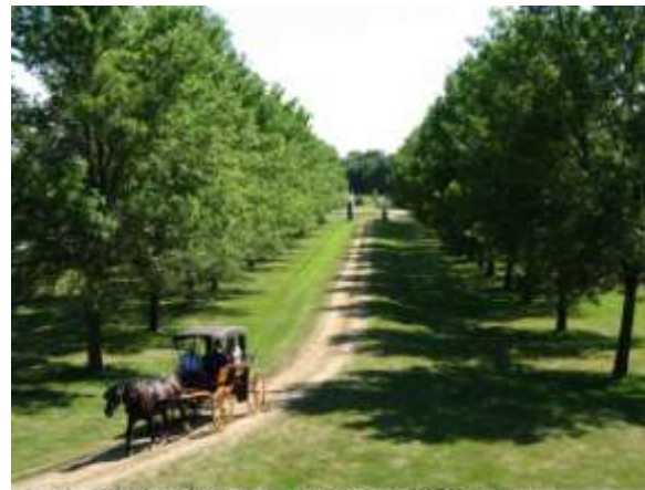
Carriage rides during Farm Fest at Gilfillan Farm, Redwood County.

Redwood County may be more famous as the location of Farm Fest , Jackpot Junction, Monsanto facilities, and the ag research station at Lamberton , but it continues to have a strong livestock industry. There are nearly 350 registered feedlots in Redwood County, including 14 NPDES operations. The numbers are well distributed among beef, dairy, swine, and poultry operations. Each August, Farm Fest draws nearly 40,000 visitors to the 50+ acre site adjacent to the historic Gilfillan Farm. In recent years, the show has included more livestock displays and demonstrations. As director of the Redwood County Environmental Office, Jon Mitchell works on feedlot issues with MPCA feedlot staff from the