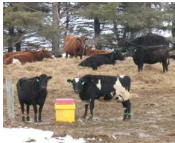
Straw bedding generates warmth for organic dairy herd wintering outside.

A small group of farmers learned more about wintering systems for "alternative" swine and dairy production at a tour March 18 at the West Central Research and Outreach Center near Morris. What's called alternative today may not be much different than the conventional ways of earlier generations. Swine can thrive in well-managed hoop barns. An organic dairy herd finds warmth outdoors atop a large mound of straw compost. Bedding and manure from the hoop barns is composted and land-applied. The tour was sponsored by the " Profits from Perennials " project of the Land Stewardship Project and Chippewa River Watershed Project. The purpose is to find profitable ways to raise crops and livestock using methods that will sustain land and water resources.