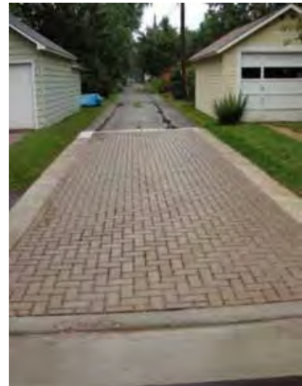
Pavers at the drain end of this alley provide significant infiltration. Alleys can be excellent low-traffic test plots for cities that want to improve stormwater practices.