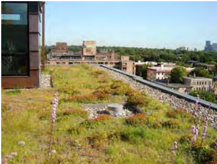
Green roofs reduce the volume of stormwater runoff from buildings, and also help reduce cooling costs and urban heat island effects.

No. MIDS will offer a package of options for local governments and developers to consider in design, based on local needs and community preferences. This will be similar to the way the Minnesota Stormwater Manual serves as a general reference for stormwater management. The standards will not be mandatory; however, future components will offer tangible measures of community management that could demonstrate compliance with Total Maximum Daily Loads, nondegradation and water quality/management goals. A particular design, methodology or pollution reduction goal could become mandatory only if state or local governments took action (outside the scope of this project) to put it into a permit, rule, ordinance or similar requirement.