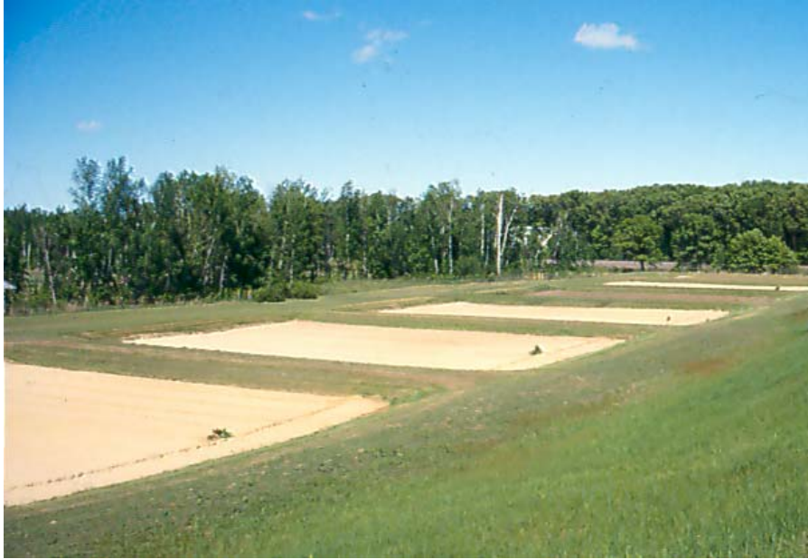
Figure 1: Rapid Infiltration Basins.