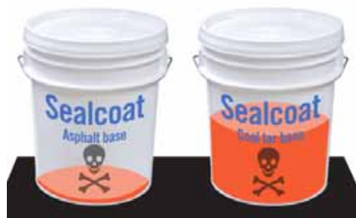
Figure 1: Relative amounts of PAHs in sealcoat products

An Austin, Texas, study determined that sealcoat products based on coal tar contained up to 1,000 times more PAHs than asphalt-based products. Consider asphalt-based sealcoat if you choose to coat your driveway.