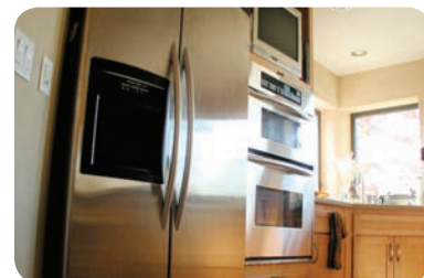
Energy Star appliances