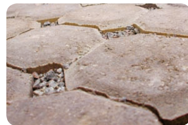
Pervious paving for driveways and walks