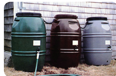
Runoff-reducing rain barrels