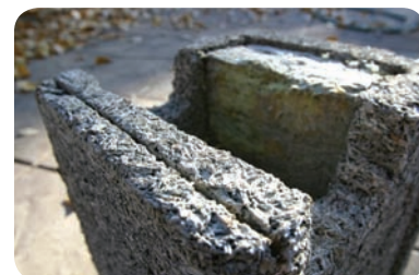
Concrete insulated with wood waste