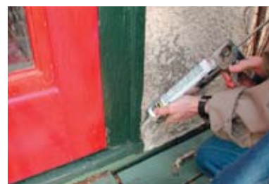
Caulk cracks and weatherstrip windows and doors to eliminate easy paths of entry. Check your foundation for cracks or spaces.