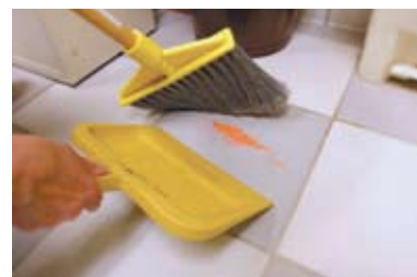
Clean up food spills completely.

If you're looking for a way to decrease your use of toxic chemicals in your home, take a look at how you handle unwanted pests. The best method to control pests, such as bugs and rodents, inside your home is to keep them out by cleaning up crumbs and spills quickly. Instead of reaching for a can of toxic spray, grab a broom!