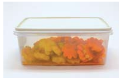
Store food in tightly sealed containers.