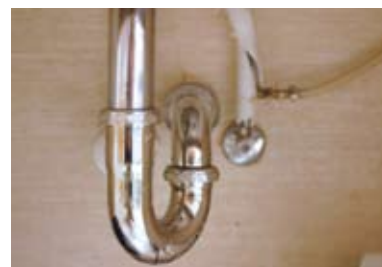
Plumbing leaks and damp basements can be an essential source of water for insects. Get rid of the moisture, and you could solve your bug problem.