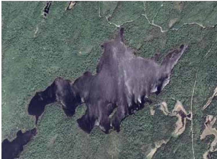
August Lake Land Use Lake County