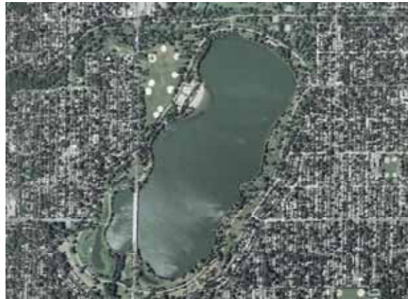
Lake Nokomis Land Use Hennepin County