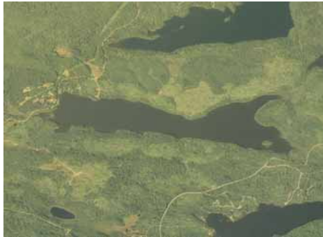
Aspen Lake Land Use Cook County