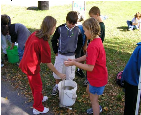
4 th grade students using a transparency tube at River Keepers' Red River Water Festival in September 2004.

With kids back in school there are many opportunities to share your time and knowledge with area students! Below, students attending the Red River Water Festival in Moorhead, MN learn to use a transparency tube to measure the clarity of the Red River. Water festivals happen around the state and are always looking for volunteers and/or presenters. Check with local watershed groups, nonprofits, schools, or county environmental staff to see how you can help.